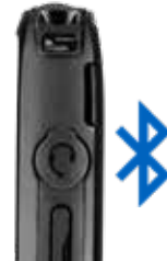
SUPPORTS OTHER 3RD PARTY 3.5 MM AND BLUETOOTH ACCESSORIES