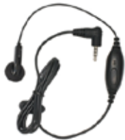
3.5MM EARBUD WITH INLINE MICROPHONE AND PUSH-TO-TALK