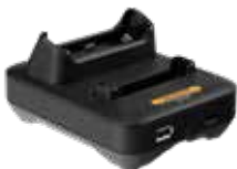
SINGLE UNIT DESKSET CRADLE

NEVER SLOW DOWN JUST SWAP OUT THE DEPLETED BATTERY FOR A NEW ONE