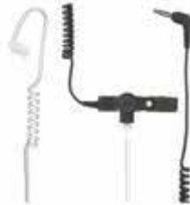
3.5MM TWO-WIRE EARPIECE WITH TRANSLUCENT TUBE