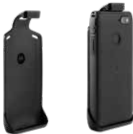
LEX L11 HOLSTER WITH AUDIO ROUTING TECHNOLOGY