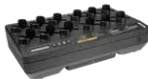
MULTI UNIT CHARGER

Charge the LEX L11 and it's spare battery at once